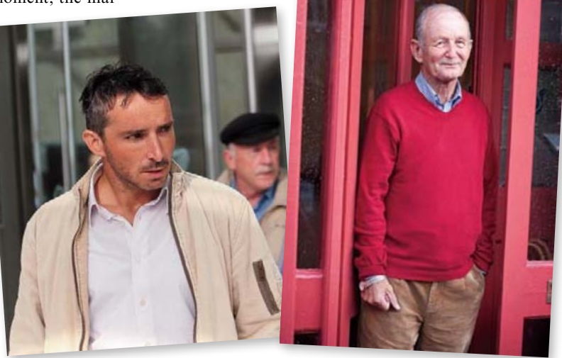
MEN OF ACTION

a nut before winter. He tortures himself and sometimes his loved ones too. What